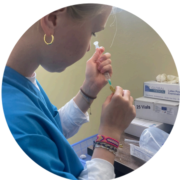
Medicine & Healthcare